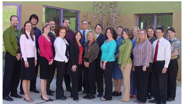
Our CivilWorksInc2 team ready to serve YOU on your next project!

CivilWorksInc2 has an exceptional understanding of our clients and their unique needs, and has an energy and dedication to help you succeed.