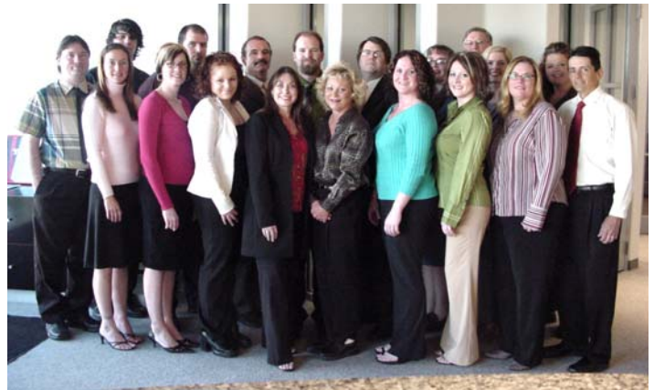
Our CivilWorksInc 1 team ready to serve YOU on your next project!

CivilWorksInc 1 has an exceptional understanding of our clients and their unique needs, and has an energy and dedication to help you succeed.